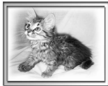
A policeman had noticed a tiny animal meowing in a manhole on a busy street and reported his sighting to CAP. Responding quickly, our volunteer heroine was lowered into the manhole and was able to scoop the terrified kitty into a net. A CAP foster caregiver immediately offered to take in the abandoned kitten now named Liberty.