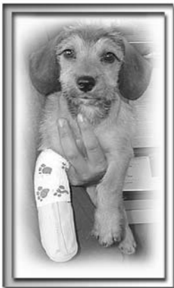
Six-week old Snoopy was found at the side of the road. He had a broken leg which had been crudely splinted with a paint stick. A kind gentleman rescued Snoopy and brought him to CAP.