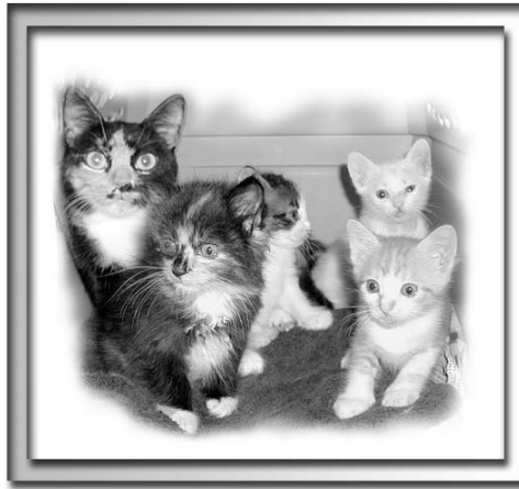
Star and her kittens — Construction workers heard noises coming from an interior wall of a new home they were building. When they realized that an animal was stuck between the frame and sheet rock, they quickly made an opening in the wall. To their amazement, inside was a cat and her four newborn kittens.

CAP CODICIL CLUB members meet once a year at a luncheon to share their concern for all animals. Each member receives an attractive codicil club pin recognizing his or her commitment.