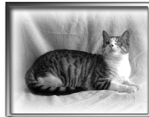
Nelson – A nice young couple found out just what that means when they took their trash out to the dumpster. They saw a nearby bag of trash moving! Upon investigation, inside they found one dirty, soaking wet little kitten. They noticed that one of his eyes did not open and rushed this ailing kitty to the CAP shelter.