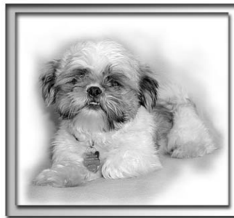
Monty a seven-month old Shih Tzu was discarded in a box at the corner of our shelter in the middle of the night. This poor little puppy was covered with infected wounds all over his body and ulcers in both eyes.